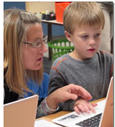
Families enjoy digital learning together at parent night.