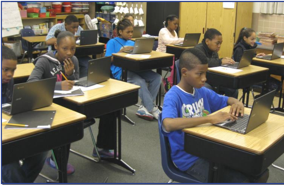
While each school's needs are different, many are adding cost-effective Chromebooks to local classrooms.