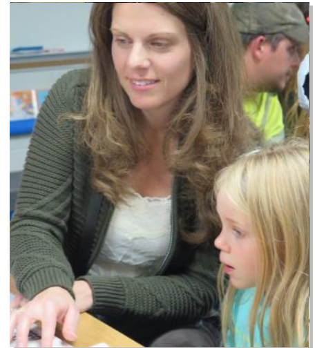
Families enjoy digital learning together at parent night.