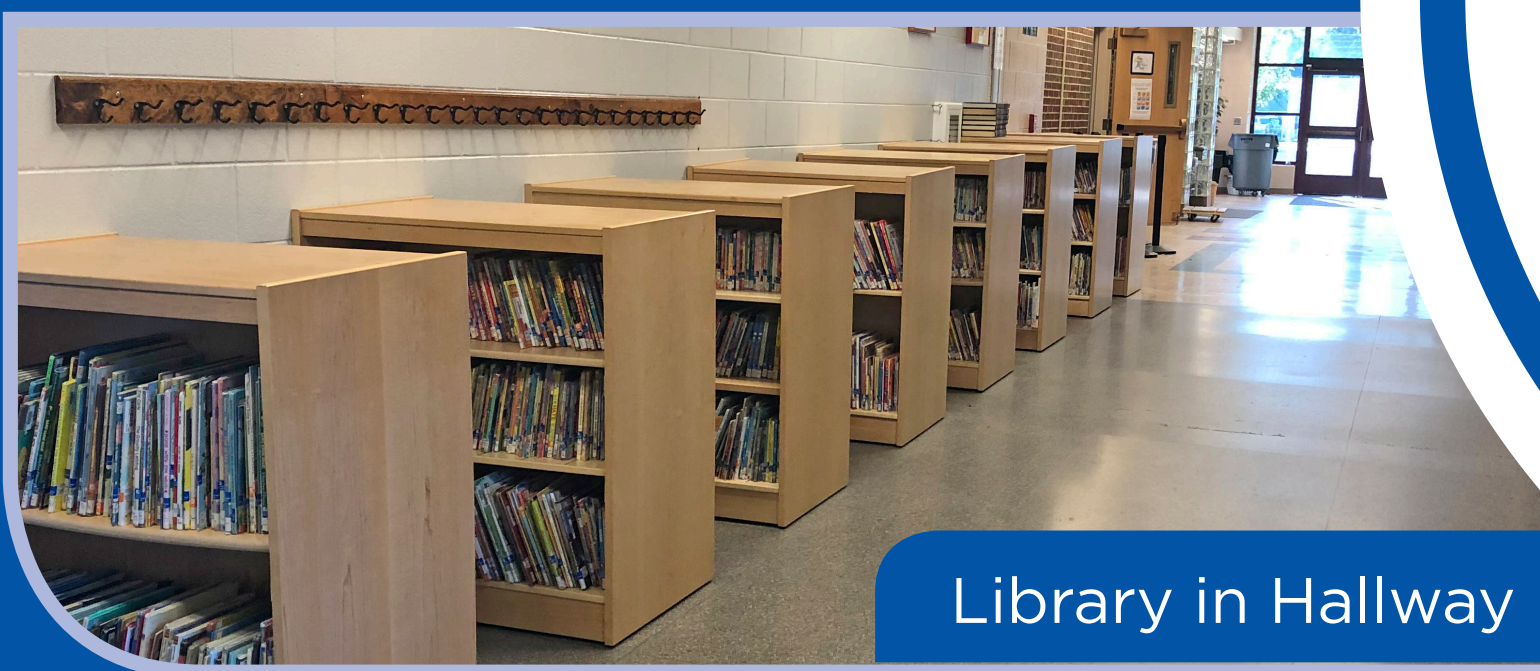
Library in Hallway